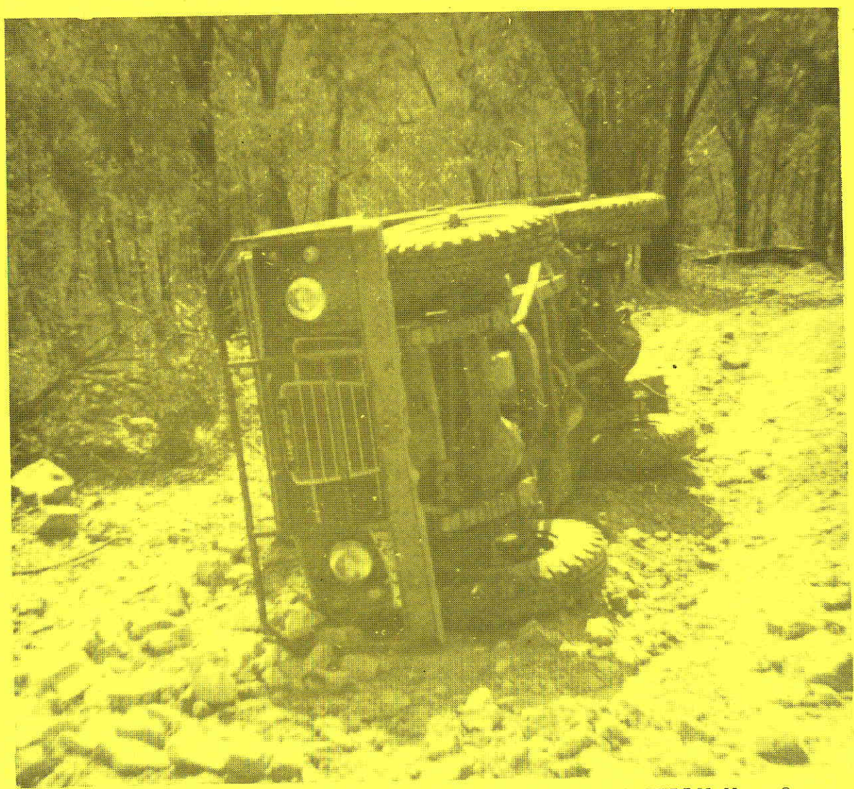
COVER : TOM BRACKNA RESTING ON KING BILLY No. 2